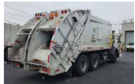
3 DSNY dual-bin truck collects organics (food scraps)