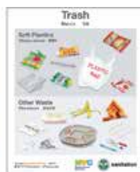
Trash landfill poster for schools without Curbside Composting