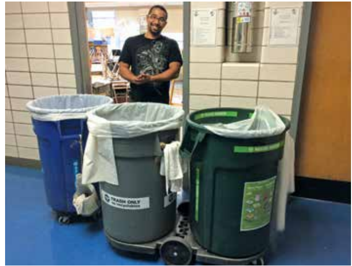
Dual-bin dolly recyclables and trash in separate piles.