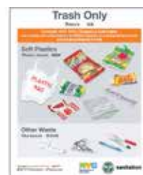
Trash landfill poster for schools with Curbside Composting