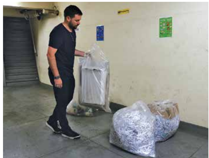
Keep bags of recyclables and trash in separate piles.