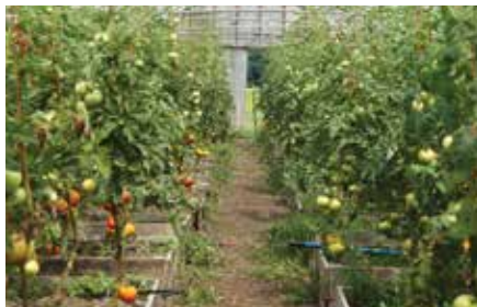
6 Compost is used to grow food