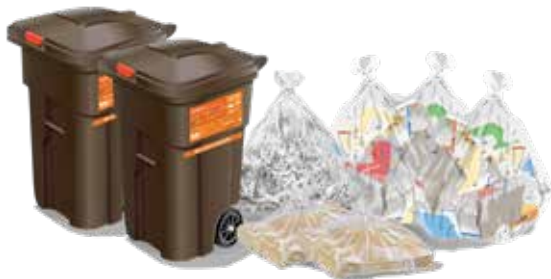
Set out brown food scraps bins and clean paper & cardboard recycling in distinct piles.