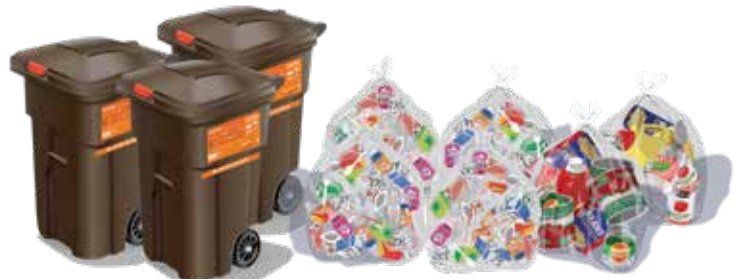
Set out brown food scraps bins and bags of metal, glass, plastic, and cartons in distinct piles.

Comply with set-out regulations for each material stream in accordance with the Department of Sanitation’s collection schedule. Schools with Curbside Composting can find their set out schedule by visiting: on.nyc.gov/organics-schools .