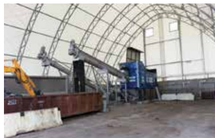
4 Organics pre-processed at local facility