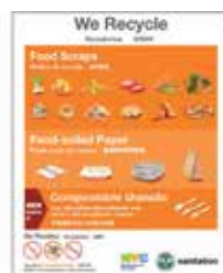
Food scraps and food-soiled paper poster