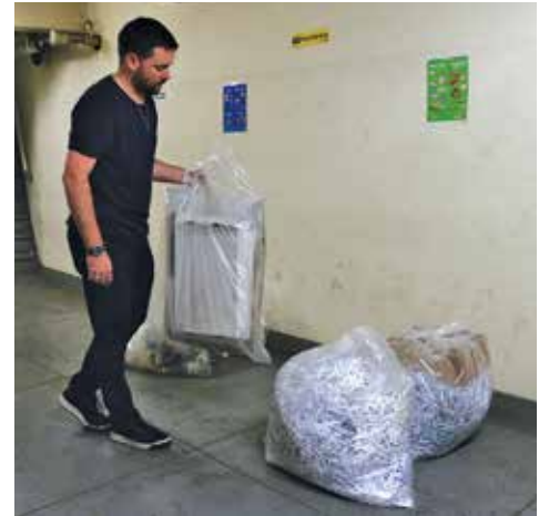
Store clean paper & cardboard, metal, glass, plastic, and cartons, and trash in three separate piles.