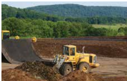
5 Organics are converted to compost