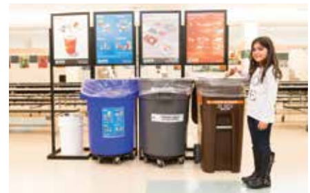
2 Food is sorted in cafeterias