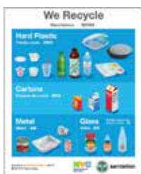
Metal, glass, plastic, and cartons poster

To order FREE decals, signs, and posters, visit: nyc.gov/recyclingmaterials .