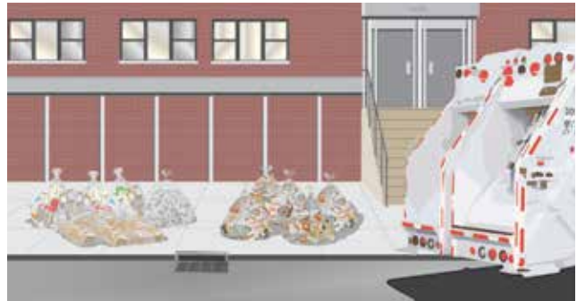
Set out trash and recyclables in distinct piles on the correct day.

Dumpsters: Some large schools may use separate dumpsters for trash and clean paper & cardboard . However, metal, glass, plastic, and cartons are always collected curbside in clear bags.