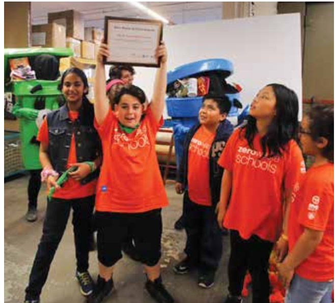
PS 90 Edna Cohen School students at the 2017 ZWS Awards.

If you have any questions on the Zero Waste Schools Awards, please email schools@dsny.nyc.gov .