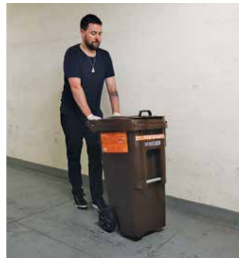
Set food scraps bins at the curb after 2 pm, but before 4 pm, every weekday.