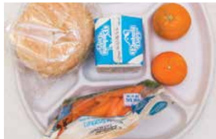
1 Food makes its way across NYC

For more information on recycling in NYC Schools, please visit: nyc.gov/zerowasteschools .