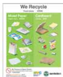
Mixed paper and cardboard poster